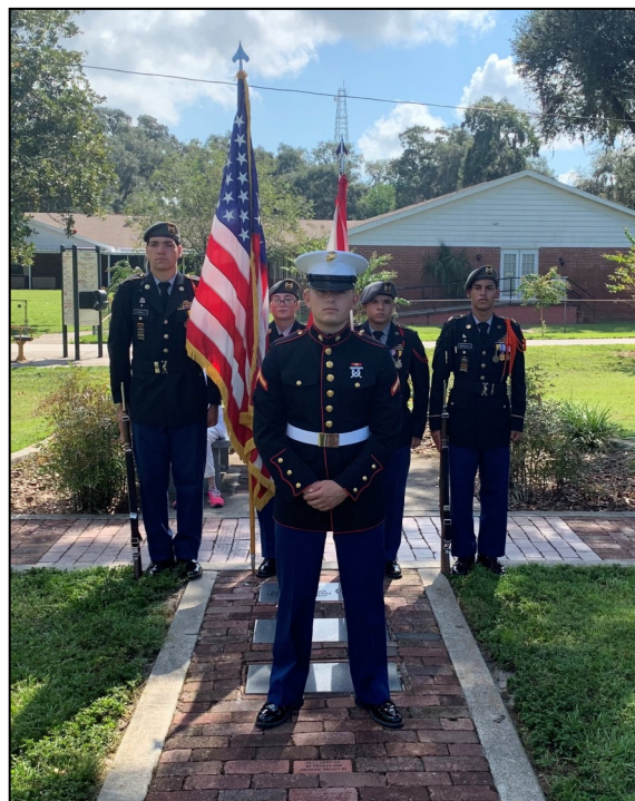
JROTC pays a special tribute to the 911 Memorial at Zephyr Park