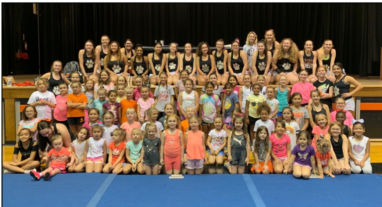
Cheerleaders with all the Junior Bulldogs!

Thank you to everyone who came and supported the Junior Bulldog program sponsored by the ZHS Cheerleaders. The girls had a lot of fun teaching younger children about cheer and then performing at the Varsity Football Game, including a half-time show.