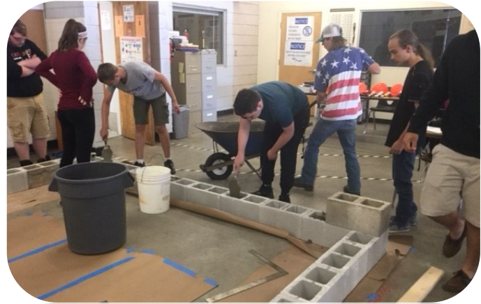
Students Learning Real World Skills