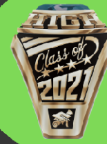
Class rings order site