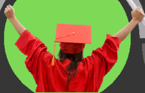
Graduation products order site