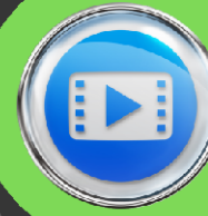
View digital class meeting

If you have any questions, please contact us at 727.381.7714