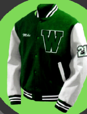
Letterman jackets order site