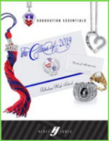
View digital catalogs

Welcome to your Senior Year! Graduation may seem like a long ways off, but preparations for your big day starts NOW . I am proud to be your school's official provider for graduation products and want to make sure that every senior has the opportunity to celebrate their achievements in a special way. This senior page provides all of the quick links that you'll need to view products and place your orders. Click the images to get started!